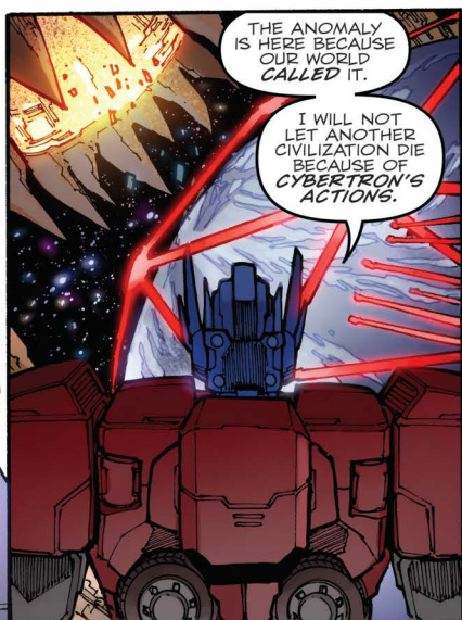
WHEELJACK, MAD SCIENTIST.

THE ANOMALY IS HERE BECAUSE OUR WORLD CALLED IT.