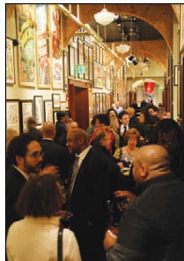
Some of the opening night crowd for the Milestones exhibit.