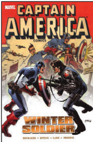
THE ORIGIN OF THE WINTER SOLDIER!