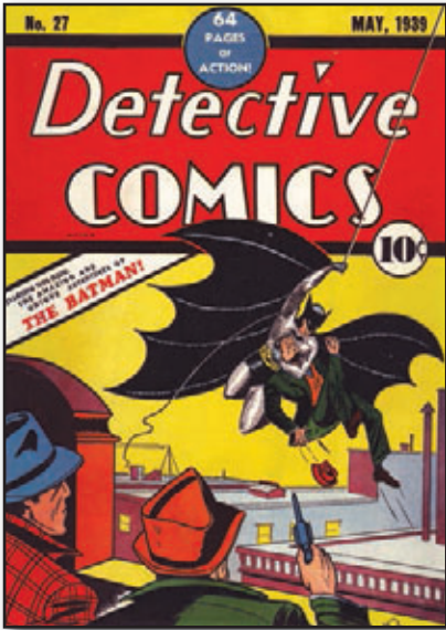
BATMAN AT 75!