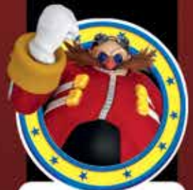
DR. EGGMAN MAD SCIENTIST