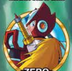
ZERO MAVERICK HUNTER