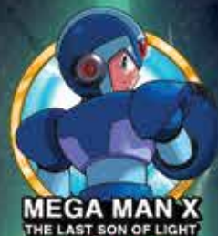
MEGA MAN X THE LAST SON OF LIGHT