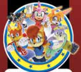
THE FREEDOM FIGHTERS SALLY, ANTOINE, NICOLE, AMY, BUNNIE & ROTOR