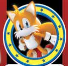
MILES "TAILS" PROWER SONIC'S BEST FRIEND