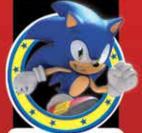
SONIC THE HEDGEHOG WORLD HERO