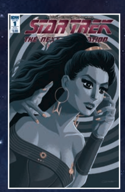
SUBSCRIPTION COVER Art by George Caltsoudas