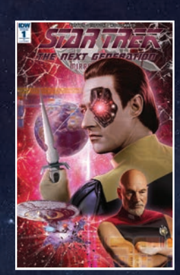
RETAILER INCENTIVE COVER Art by Joe Corroney